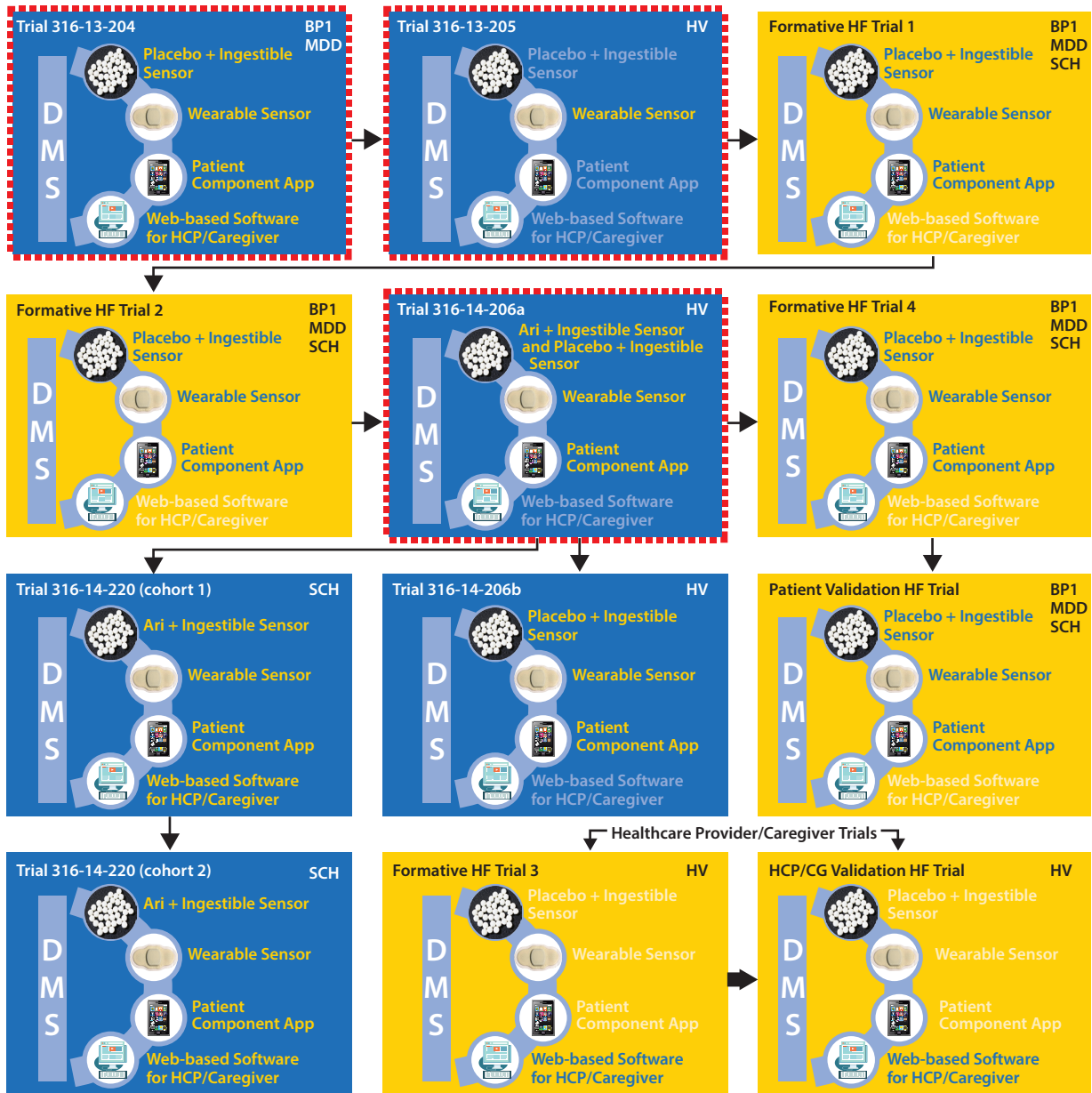
Figure 2. Schema of Investigational Trials in the DMS Development Program a